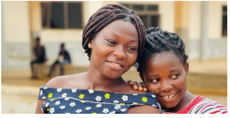
BENEFICIALS OF FEE-FREE APLICATION SYSTEM