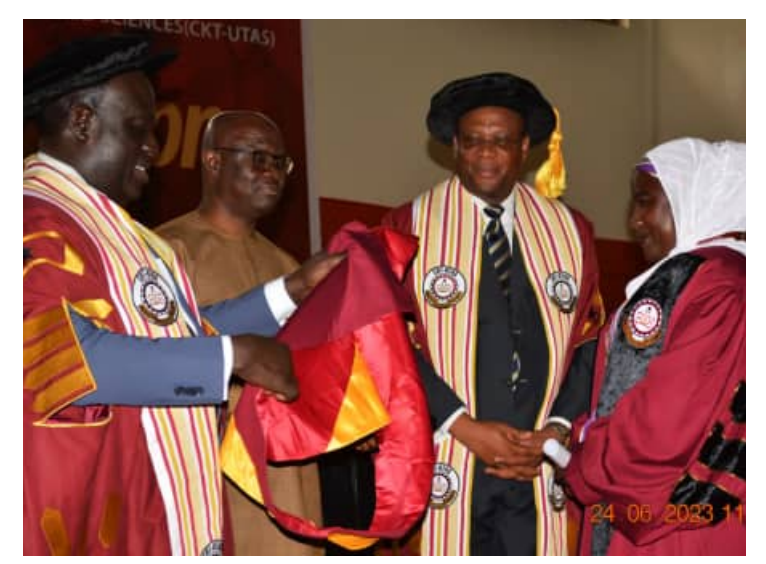
VICE-CHANCELLOR OF CKT-UTAS AWARDING PHD STUDENT WITH ACADMIC GOWN