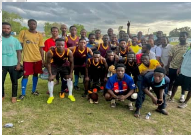
CKT-UTAS FC WINNING TEAM

This historic victory marked the University's triumphant entry into football history, being the first extramural football match organised by the Sports section since the establishment of CKT-UTAS. The football team, comprised of 23 talented players, showcased their skills and determination throughout the match.