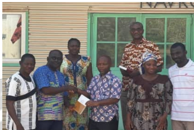
DEAN OF STUDENTS RECEIVING DONATION ON BEHALF OF CKT-UTAS