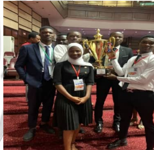
ENACTUS 2023 WINNING TEAM

15-member team. At the National Competition, Enactus CKT-UTAS unveiled standout projects like Project WasTek, which repurposes spoilt refrigerators into poultry incubators, and storage pressers. This would revolutionise egg hatching and reduce waste. Another project, Project Eco Husk, transforms rice husks and straws into eco-friendly products, contributing to the circular economy and reducing harmful emissions. The team's remarkable achievements have earned them the support of the University Management in their World Cup Competition to be held in the Netherlands as they represent the Country.